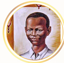
Bl. Daudi Okello

In the name of the Father, and of the Son, and of the Holy Spirit. Amen.