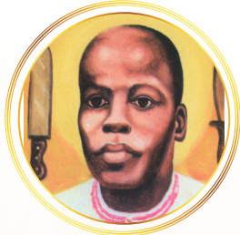
At. Andrew Kaggwa Patron of teachers, catechists and families