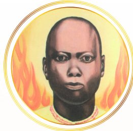
St. Anatoli Kiriggwajjo Patron of hunters and herdsmen