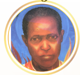
St. Yakobo Buzaabalyawo Patron of merchants and co-operatives.