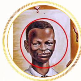
Bl. Jildo Irwa