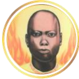
St. Anatoli Kiriggwajjo

Patron of teachers, catechists and families