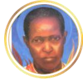
St. Yakobo Buzaabalyawo