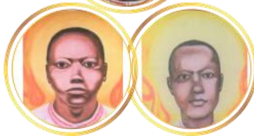
St. Mugagga Lubowa

Patron of journalists, press writers, printers and artist.