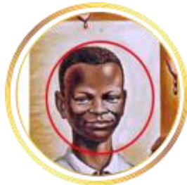
Bl. Jildo Irwa