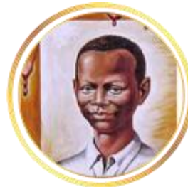
Bl. Daudi Okello

In the name of the Father, and of the Son, and of the Holy Spirit. Amen.