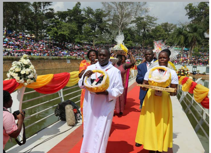
Pilgrims carrying offertory gifts