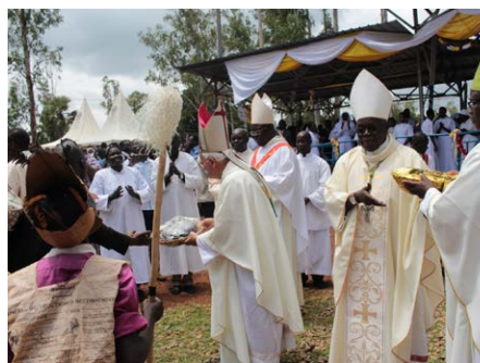
Bishops from Gulu Ecclesiastical Province (Gulu Archdiocese, Nebbi, Arua And Lira Diocese) receiving gifts

"We hear in today's Gospel that, as he was dying on the cross, Jesus looked to his mother and the disciple whom he loved, and he said to Mary, "Woman, behold, your son," and then to John, "Behold, your mother."