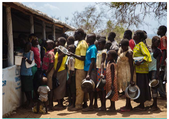
Refugees line up to receive aid.