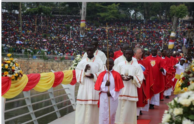
An altar boy leads a procession of priests and bishops during the celebration