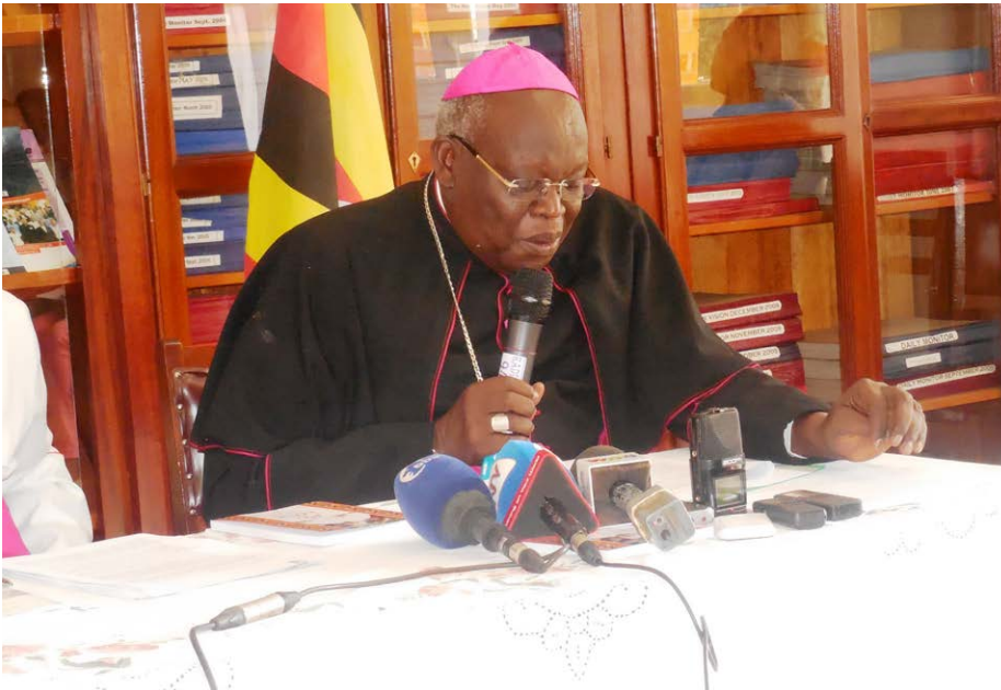
Archbishop Odama at a past press conference