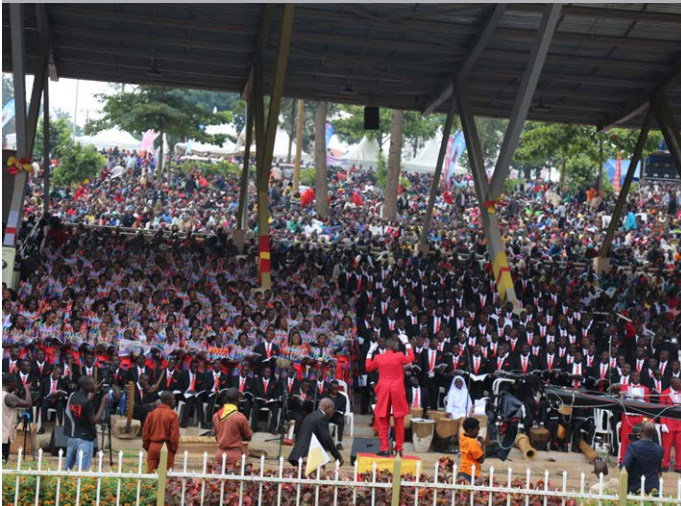
The choir from the Archdiocese of Tororo leading pilgrims in hymns