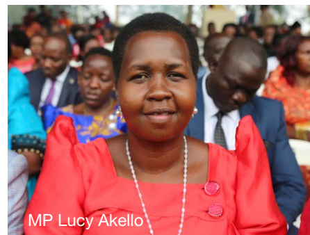
MP Lucy Akello

I have been here so many times as I was once a student at Uganda Martyrs' Secondary School Namugongo. As the Chairperson of Catholic Community at Parliament, I have seen how the numbers of pilgrims keeps increasing in every celebration. This year we registered 60 MPs and we organized three buses to bring them here. But, the three buses were all filled up and some MPs had to use their own personal vehicles therefore this shows that the pilgrimage to Namugongo has grown from strength to strength.