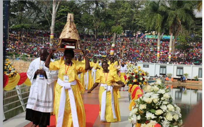
A lady carries The Book of the Gospels in a symbolic basket replicating the Basilica at Namugonggo Catholic Shrine.