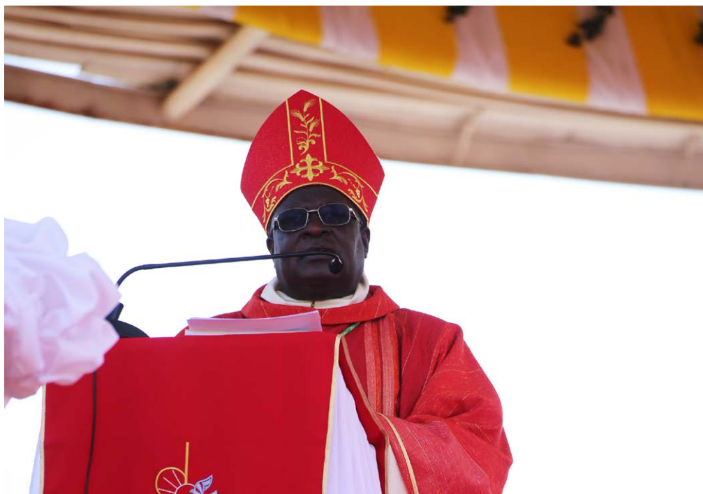
Archbishop Obbo, the main celebrant gives his homily during the Martyrs Day celebration.