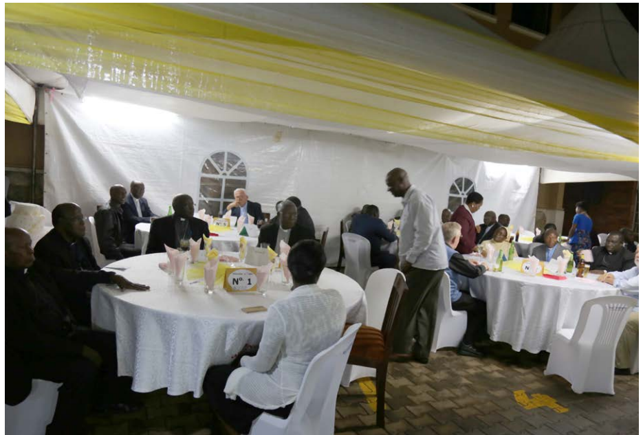
Bishops and the employees of the Uganda Episcopal Conference during the dinner