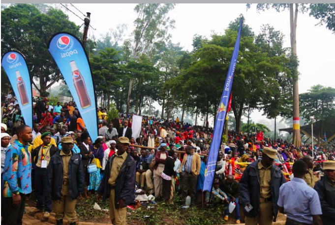
Security Officers maintain order at Namugonggo during the Uganda Martyrs celebration