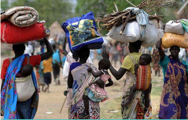
Refugees fleeing from war