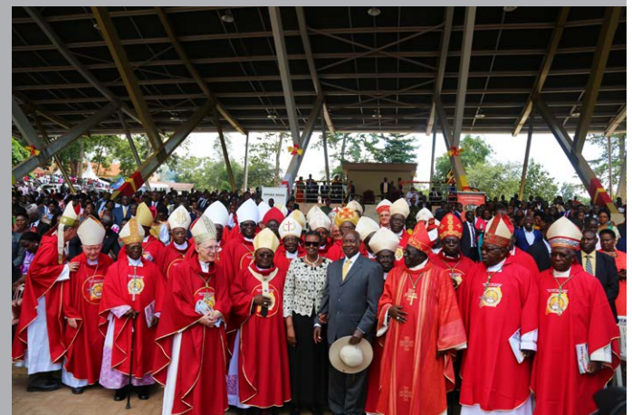
The bishops pose for a group photo with President Museveni and the First Lady after the Holy Mass of the Uganda Martyrs Day Celebration