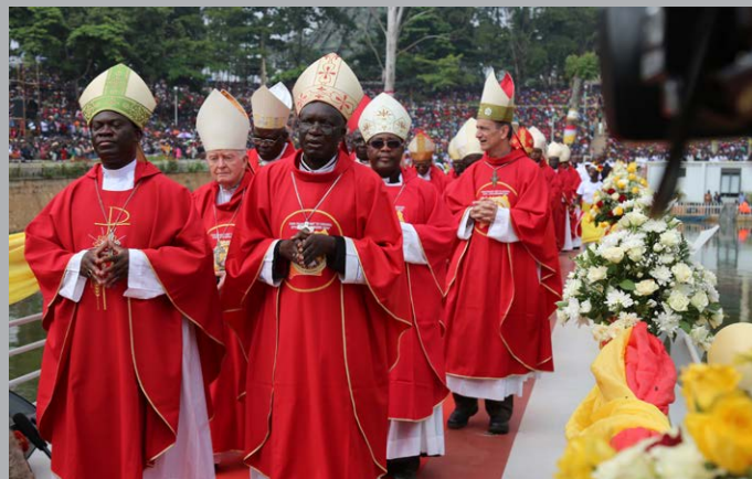
A procession of bishops during the celebration