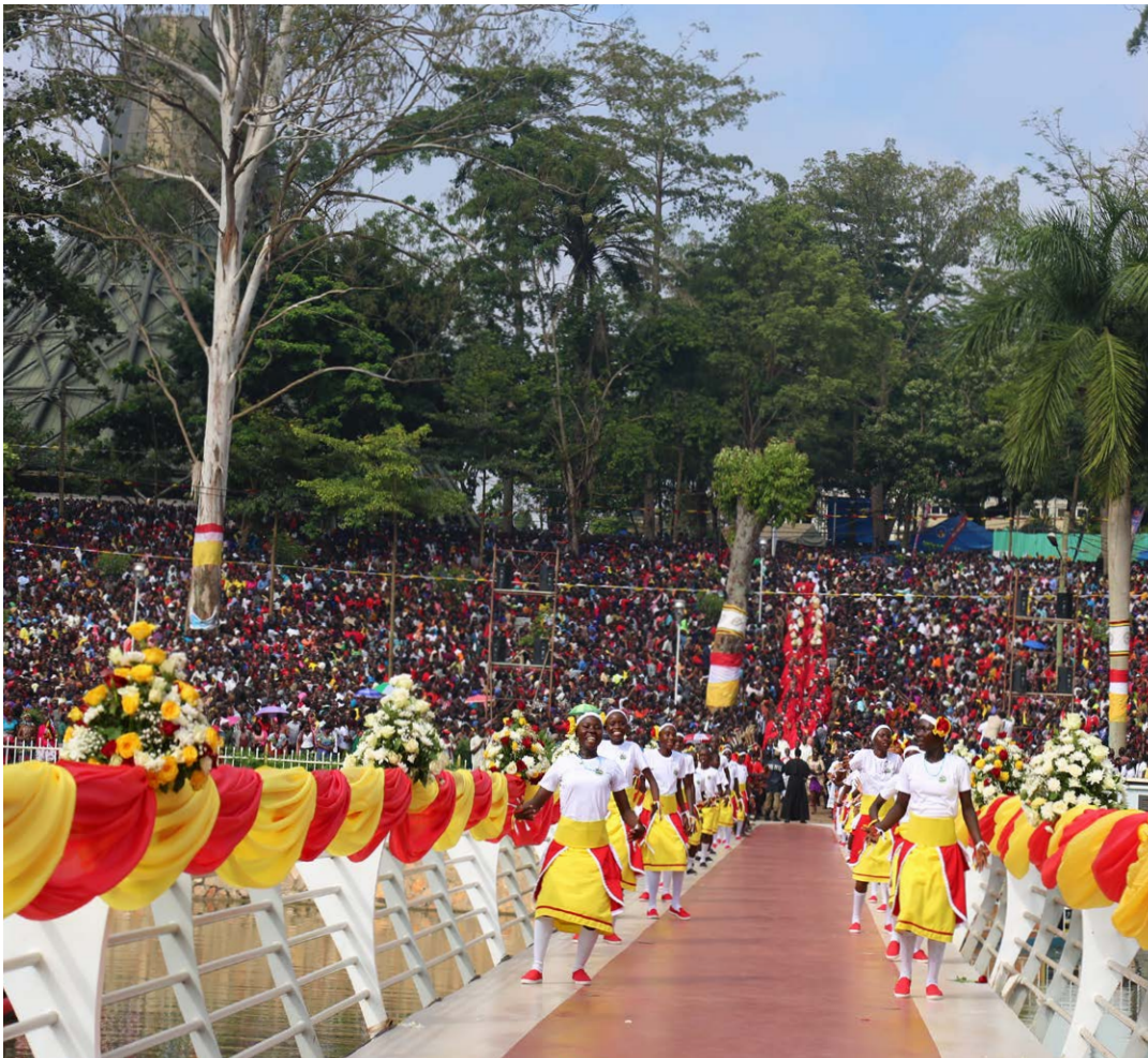
A section of pilgrims and liturgical dancers during the entrance procession of the 2018 Uganda Martyrs Day celebration at Namugongo Catholic Shrine