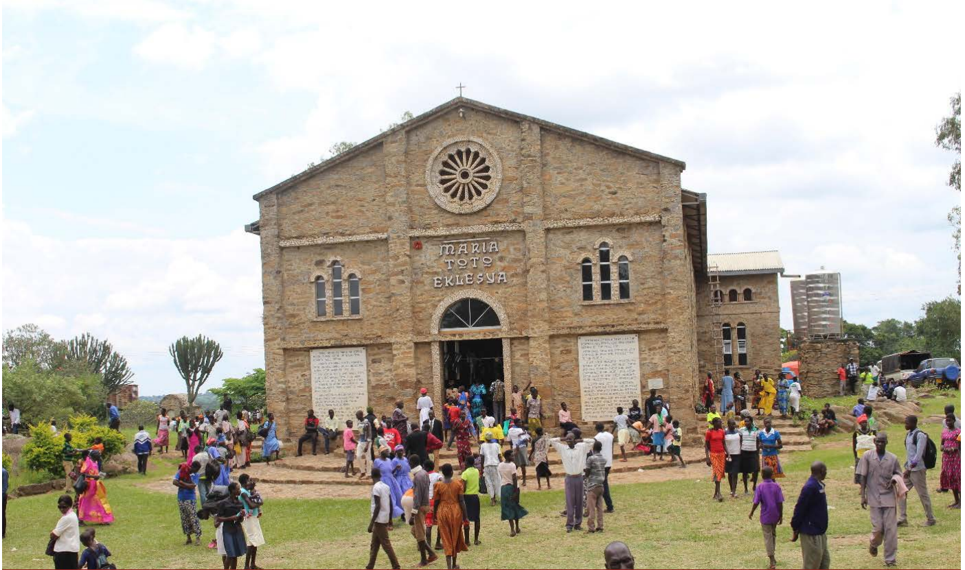
The Front view of the view of Iceme Marian Shrine before the celebration. 'Maria totoeklesia' means Mary mother of the church. The plaque in white are the prayers to mother Mary.