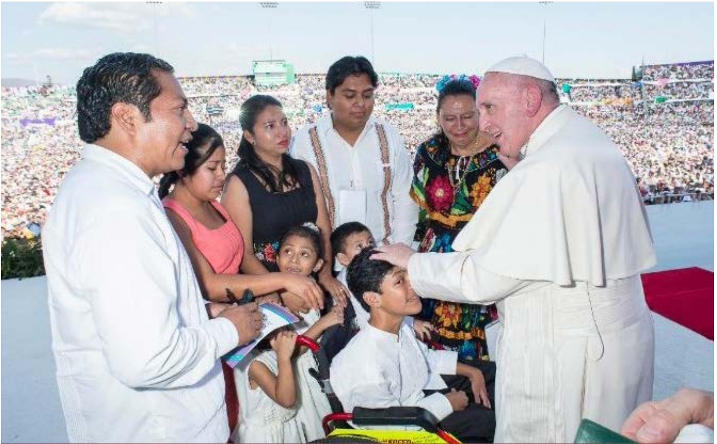
Pope meeting a family at Tuxtla Gutierrez, Mexico, on February 15, 2016. Pope meeting a family at Tuxtla Gutierrez, Mexico, on February 15, 2016.