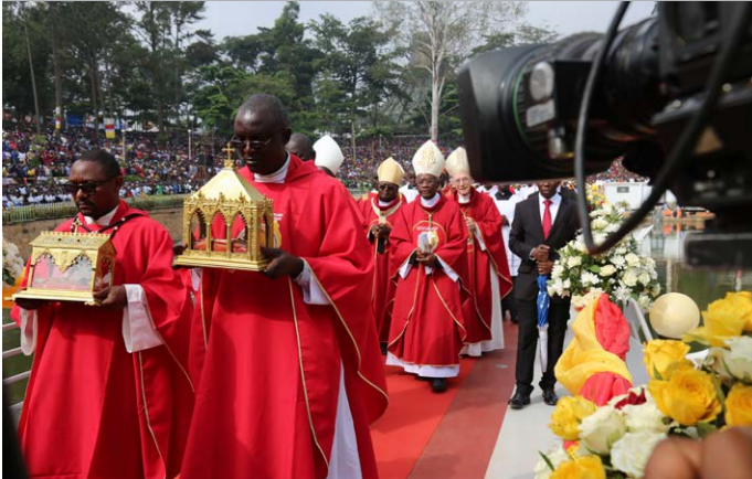
Priests carrying the relics of the Uganda Martyrs