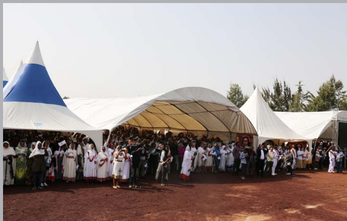
A section of the faithful during the Opening Mass of the 19th AMECEA Plenary