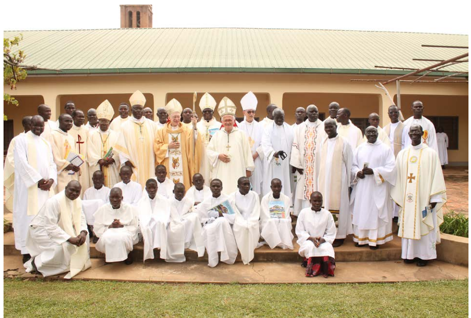
Bishops and priests pose for a group photo after the centenary celebrations

“To change the world we must be good to those who can’t repay us”