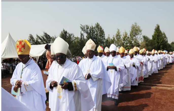
Bishops from AMECEA region in a procession for the opening Mass of the 19th AMECEA Plenary