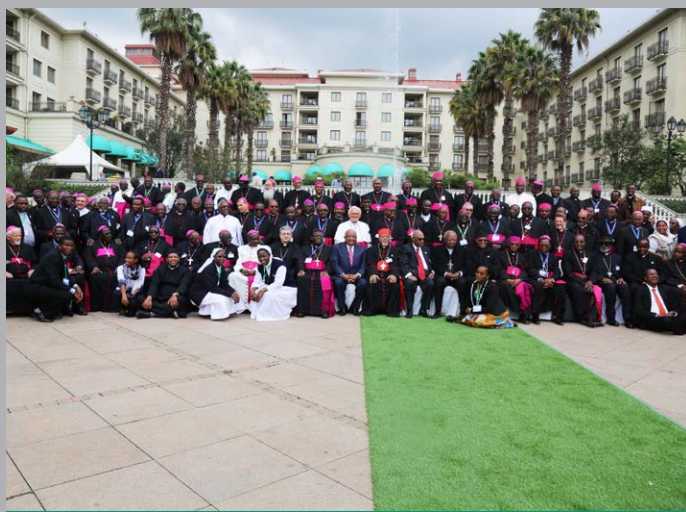
Delegates pose for a group photo with the sponsors (seated front row in suits), who sponsored the 19th AMECEA Plenary in Ethiopia