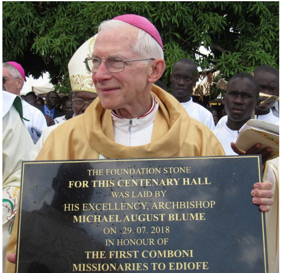
The Apostolic Nuncio to Uganda lays the foundation stone for the construction of a multimillion storeyed parish hall project.

The Mass concluded with the laying of the foundation stone for the construction of a multimillion storeyed parish hall project, centenary bell and the construction of the Cathedral tabernacle, by the Papal Nuncio.