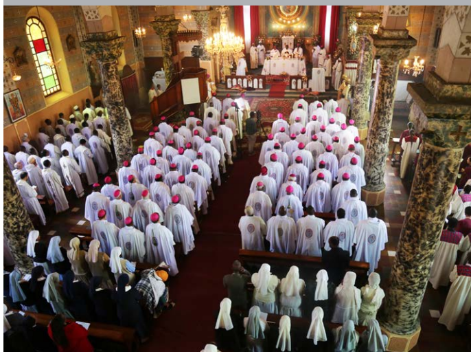
Bishops during the AMECEA Plenary Closing Mass