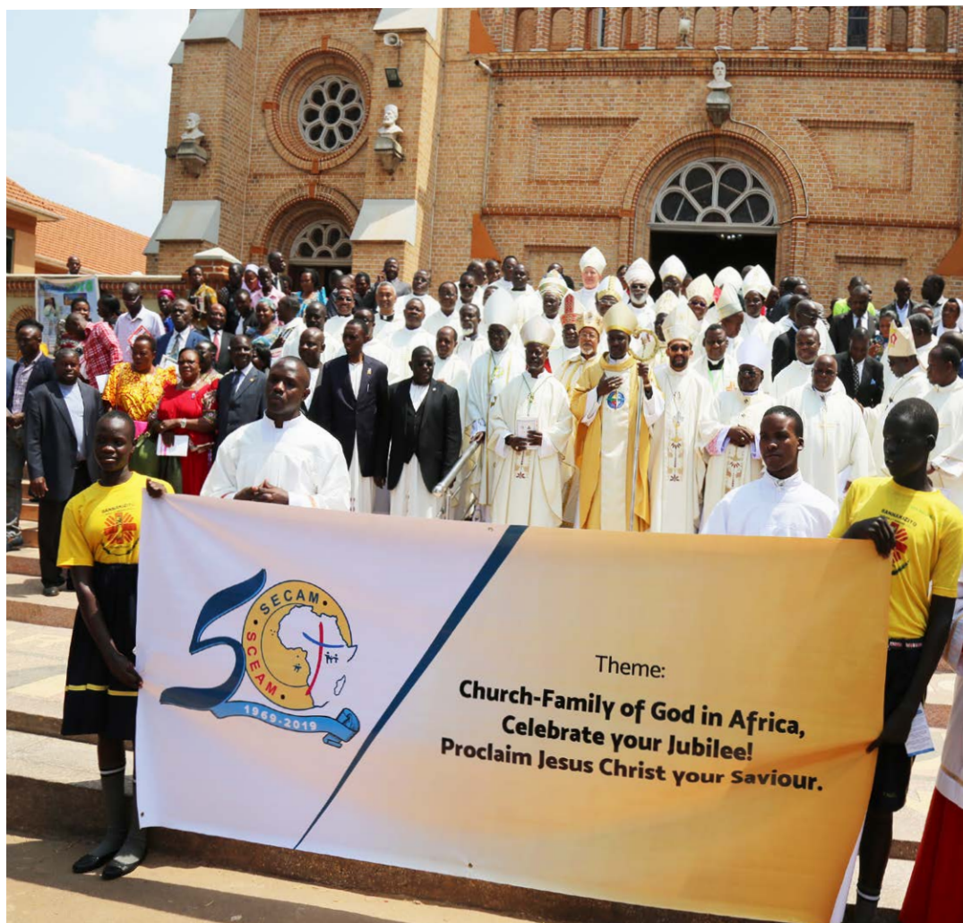
Bishops from SECAM’s eight regional conferences pose for a group photo with priests and dignitaries after the official launch of SECAM’s Golden Jubilee year.