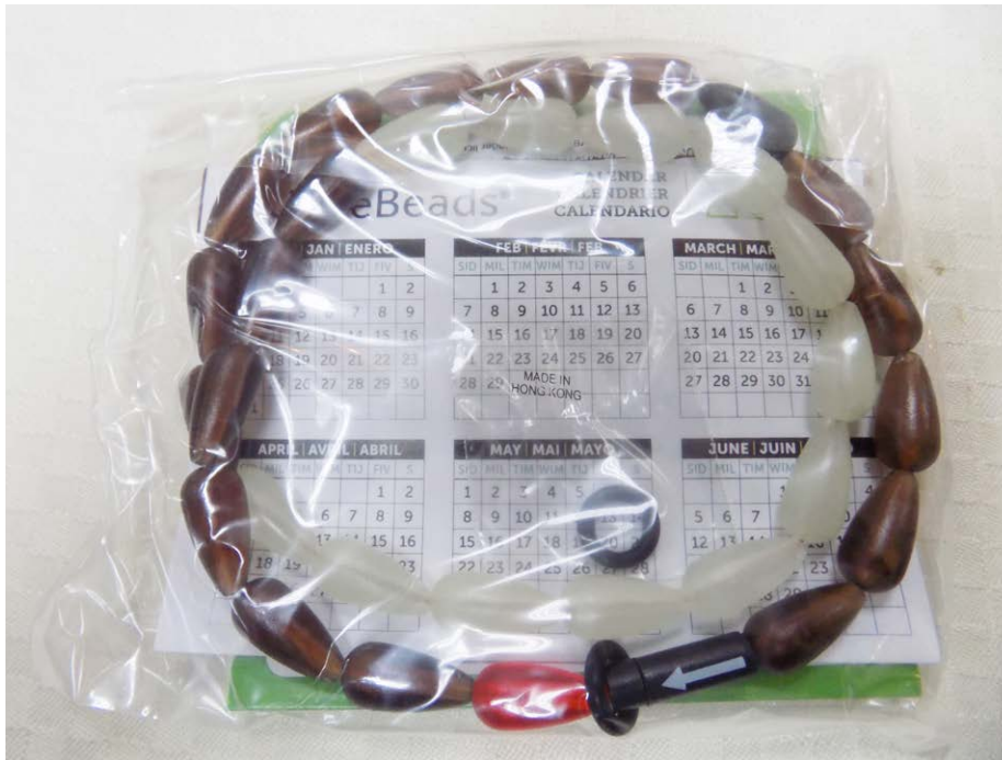
One of the natural family planning methods, the Standard Days Method with cycle beads