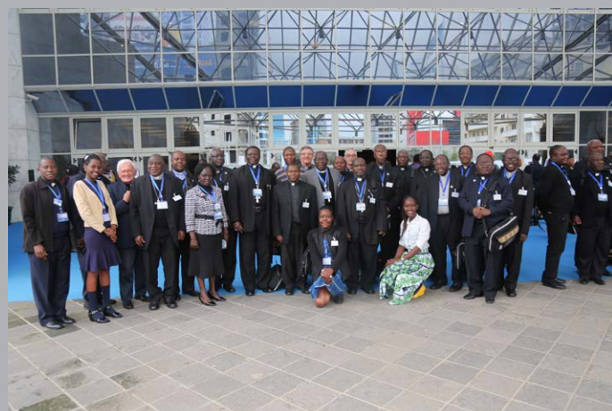
Uganda bishops and delegates