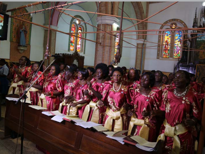
The choir during the launch