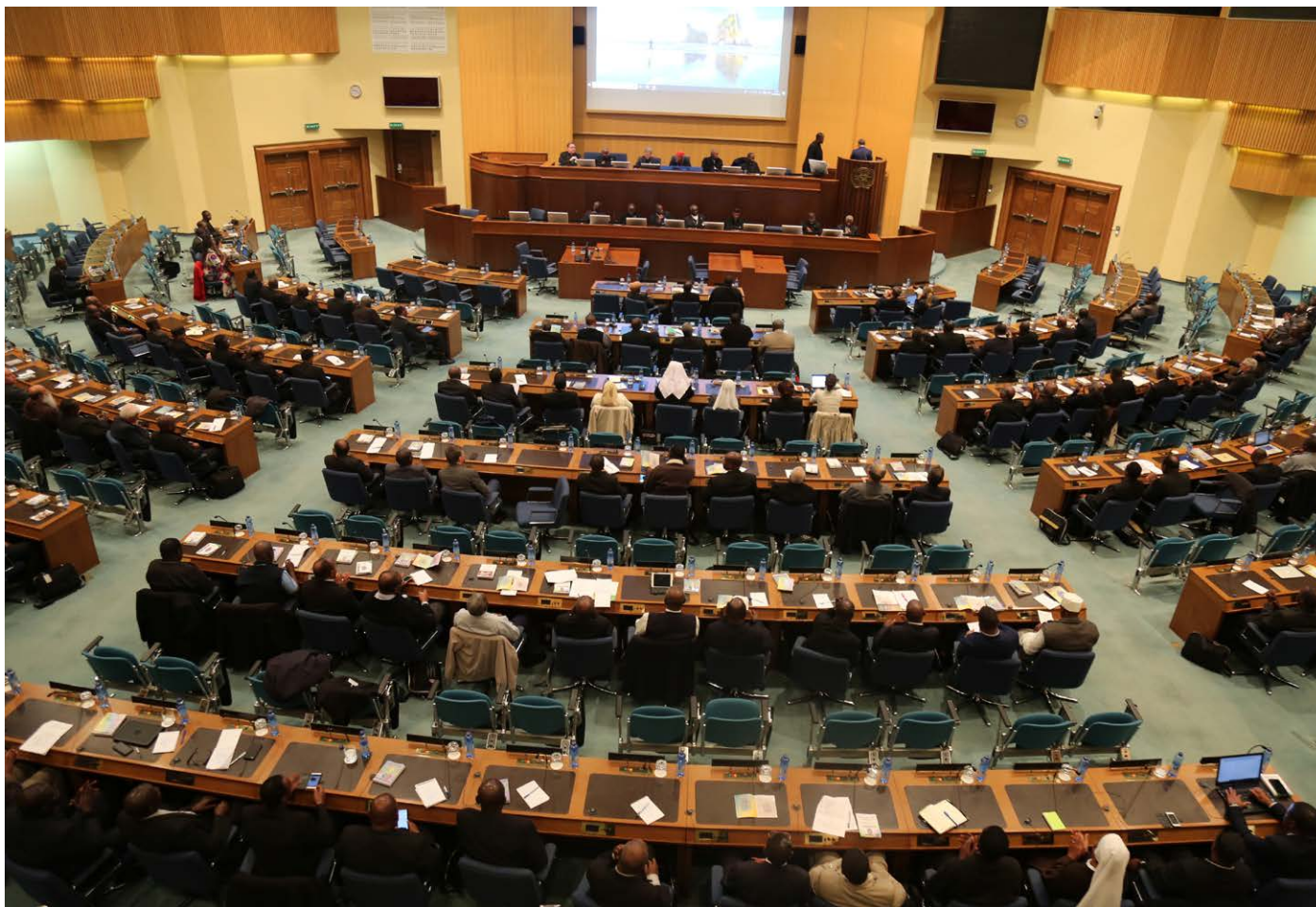
Delegates during the 19th Plenary Assembly in Addis Ababa.