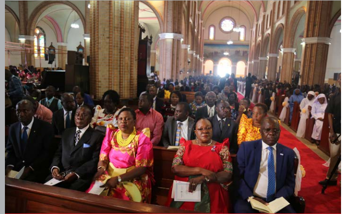
A section of the faithful during the celebration at Rubaga