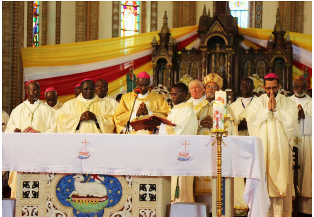
Bishops from various SECAM regional conferences during the Eucharistic celebration in Rubaga Cathedral