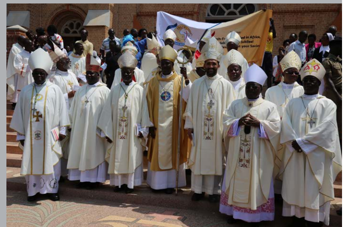
Bishops from SECAM's eight regional conferences pose for a group photo after the official launch of SECAM's Golden Jubilee year.