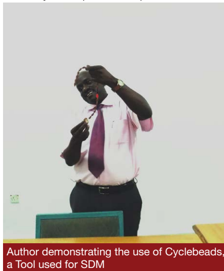
Author demonstrating the use of Cyclebeads, a Tool used for SDM

The Standard Days Method is an easy way to track the fertility cycle and fertile window for women whose menstrual cycle lengths are 26–32 days and has proven to be effective from various studies which revealed 95% effectiveness rate in perfect use (when it is used correctly and consistently all of the time) and an 88% typical use rate (takes into account how the average person uses the birth control method in the real world); while The Two Day Method showed an effectiveness rate of 96% with perfect use and over 86% with typical use, also commensurate with barrier methods ▶