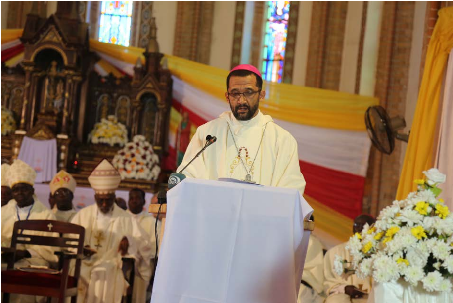
Bishop Sipuka gives his homily

► and continental level on broad issues of human rights and environment in order to fight against poverty, diseases, social injustices, war and corruption.