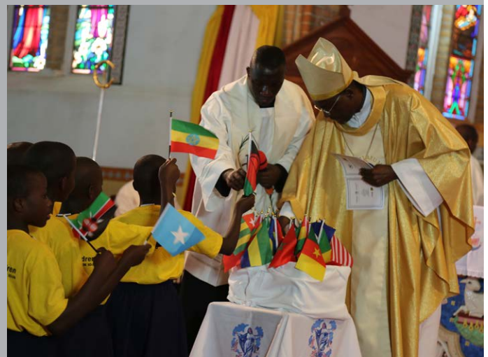
Children placing flags of SECAM's regional and national conferences