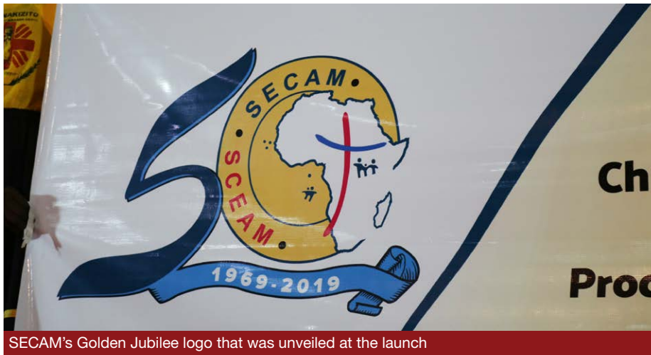
SECAM's Golden Jubilee logo that was unveiled at the launch

By Fr. Don Bosco Onyalla, Catholic News Agency for Africa