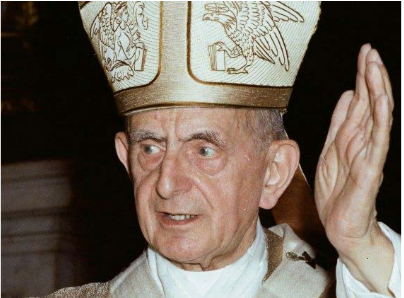
Blessed Pope Paul VI