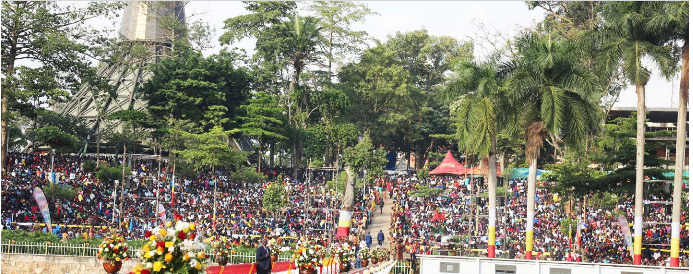
A multitude of pilgrims at Namungongo