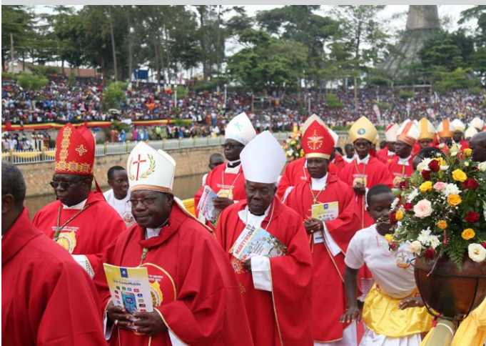
Bishops in the procession for the celebration