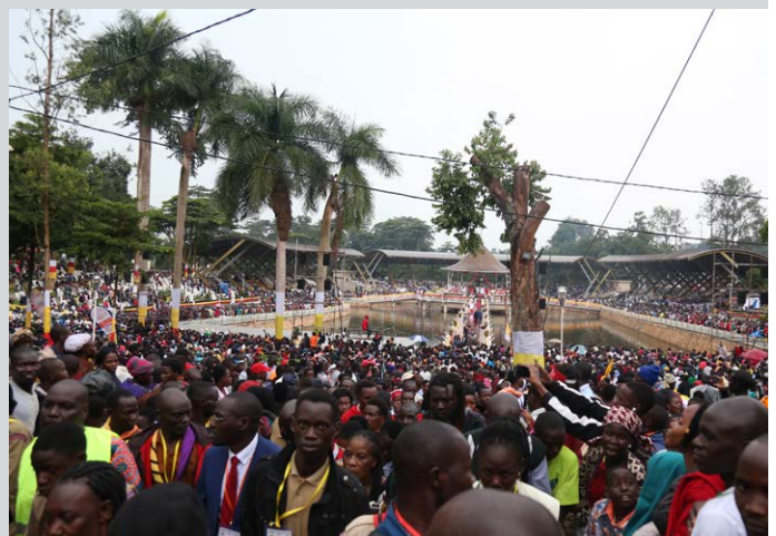
Pilgrims leaving Namugongo