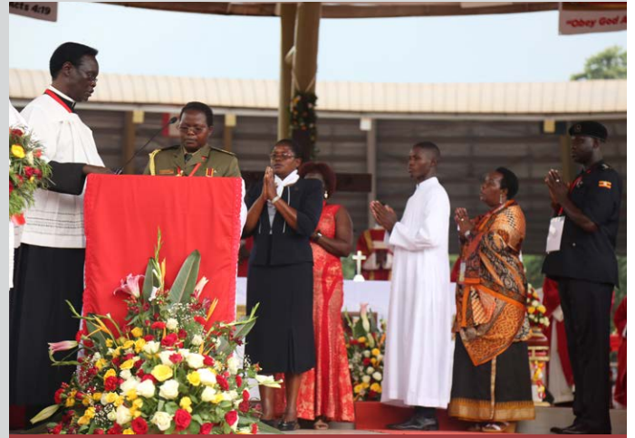
Pilgrims present their petitions