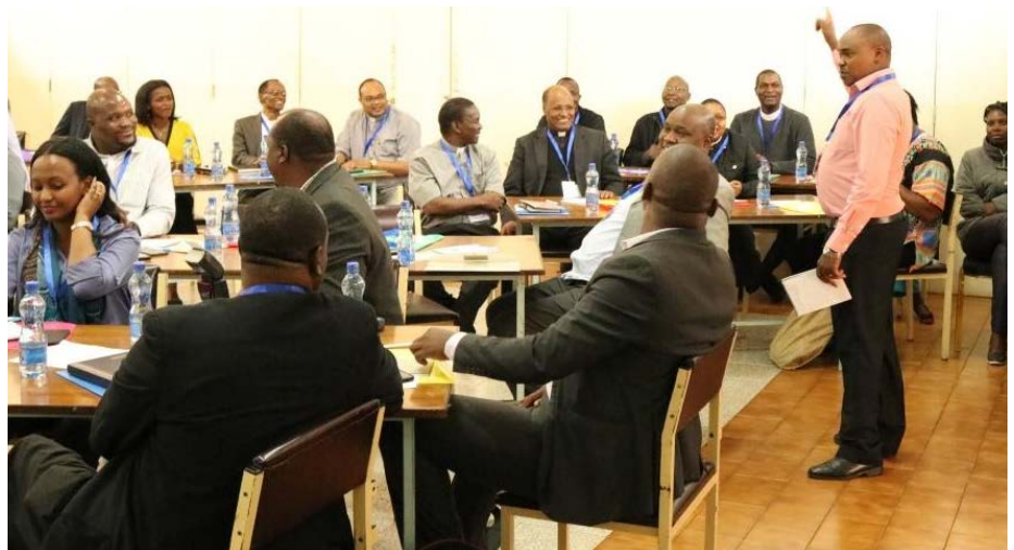
A cross section of participants during the seminar

representatives from each conferences all over the world, Pope Francis said that abuse of minors is satanic and clearly stated that all everyone must change the mentality regarding the impeccable seriousness of the issue of child safeguarding.