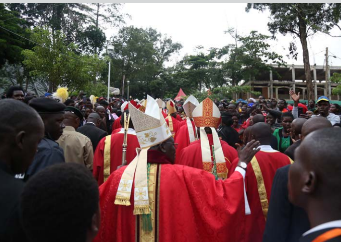
Bishops say farewell to the pilgrims after the celebration