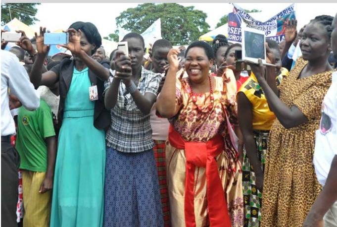
A section of the faithful from Soroti diocese jubilate after the installation of their new bishop