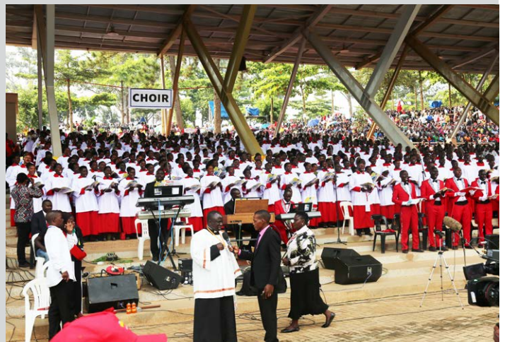
The choir from Gulu Archdiocese animating the celebration