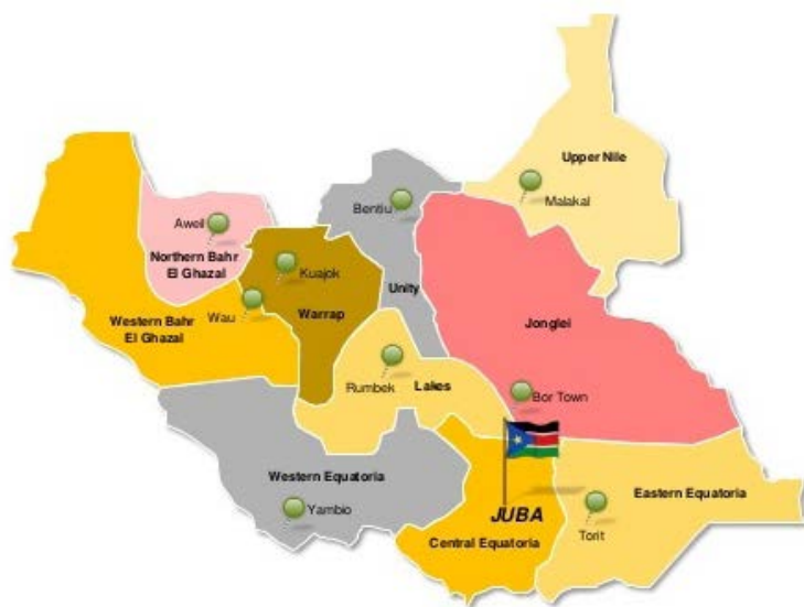
Amecea 3) The-republic-of-south-sudan