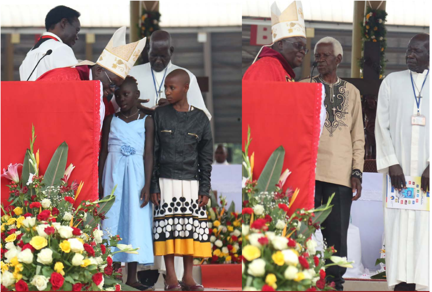
Archbishop Odama introducing the three pilgrims from Mbarara Archdiocese who trekked to Namugongo for more than 300 km