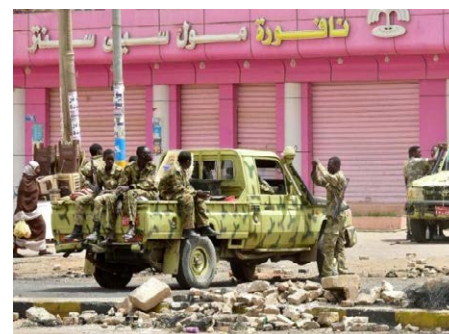
Sudanese soldiers stand guard a street in Khartoum

It's reported that a number of bank, electricity and transport workers were arrested prior to the strike. The main roads and squares in Khartoum have