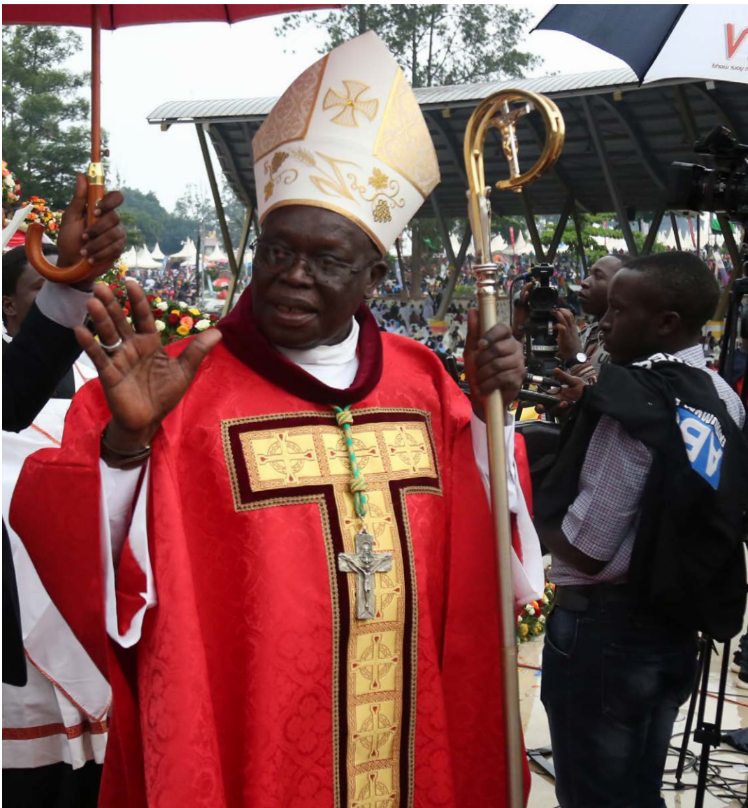
Archbishop Odama, waves to the pilgrims during the procession of the 2019 Uganda Martyrs Day celebration Story on Page 3