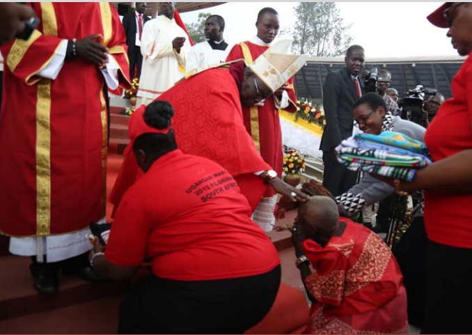
Archbishop Odama blesses an elderly lady after she presented her offering (a chicken)