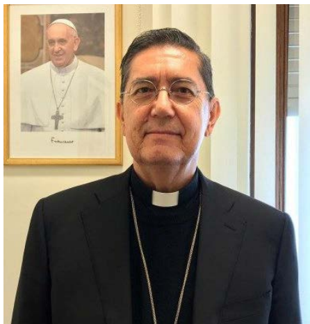
Bishop Miguel Ángel Ayuso Guixot, the new President of the Pontifical Council for Interreligious Dialogue