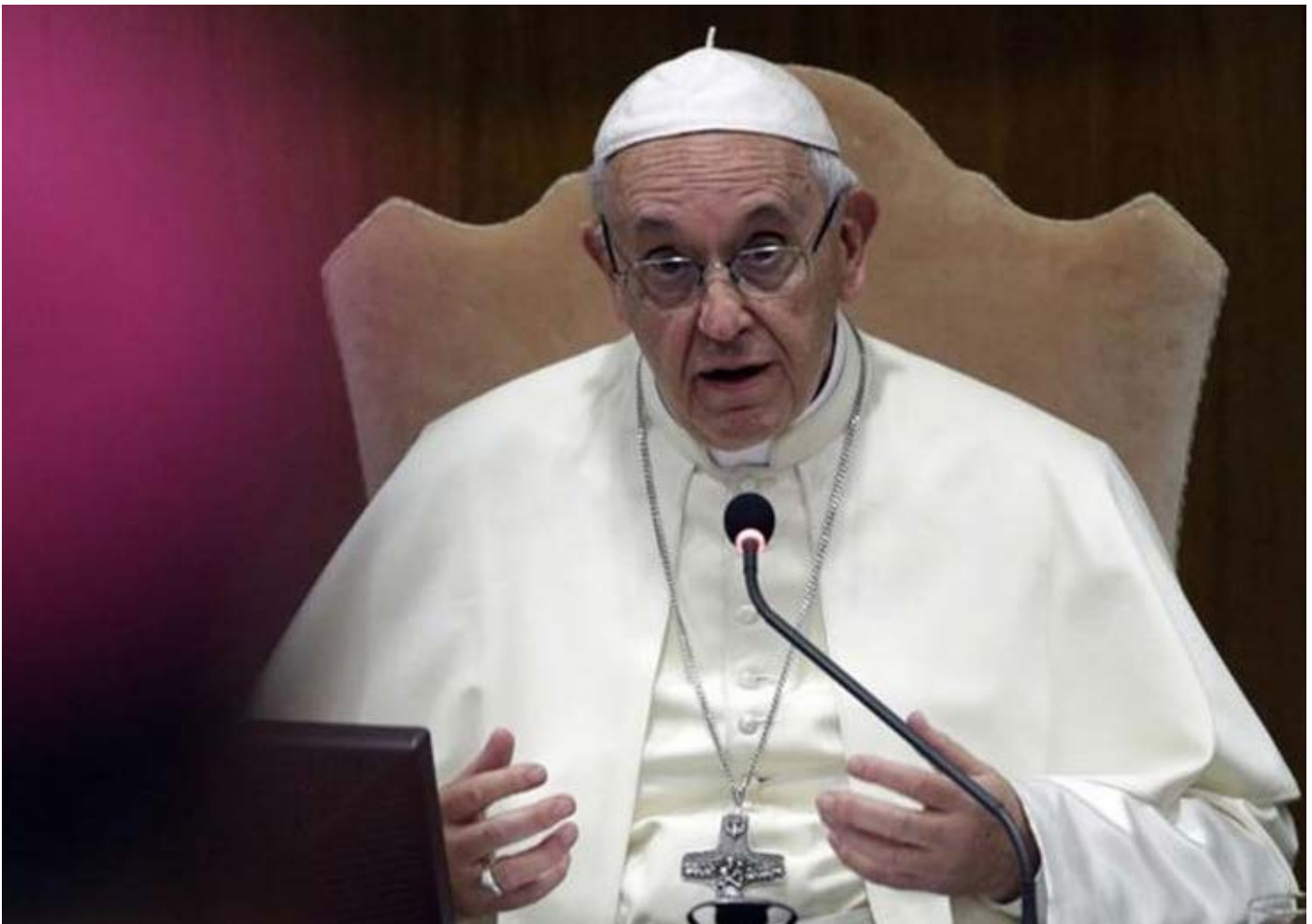
Pope Francis