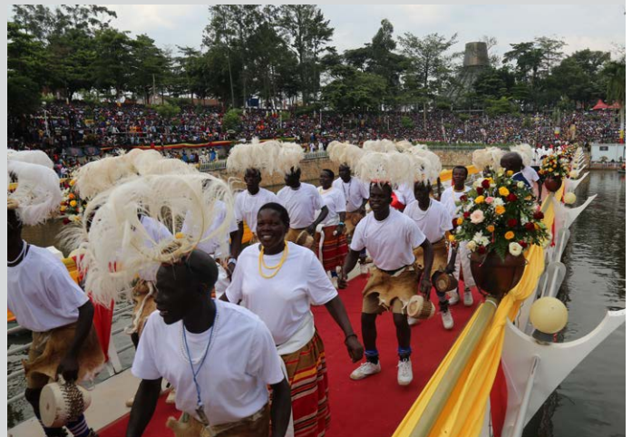
Cultural dancers performing a traditional song