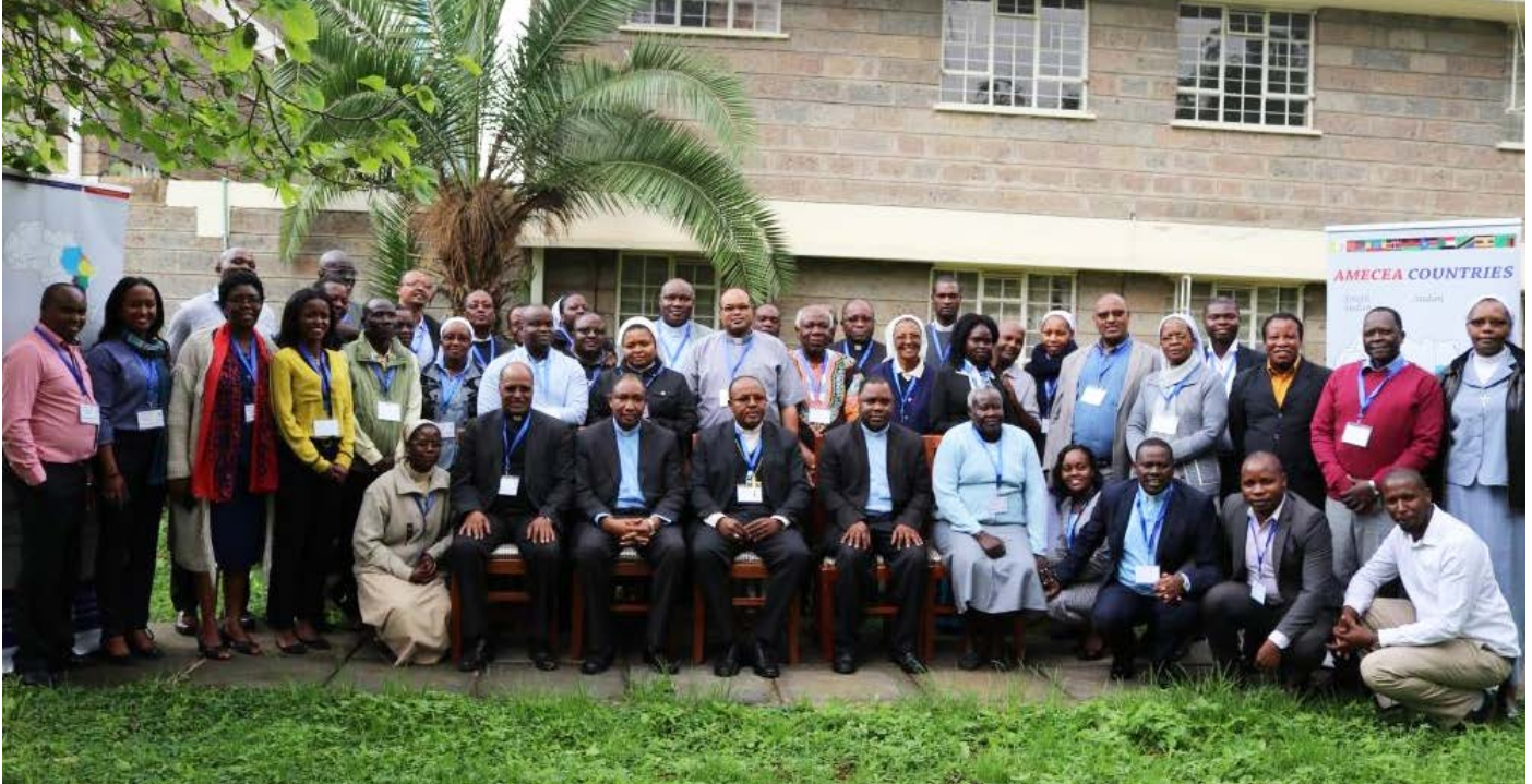
A cross section of participants during the seminar

By Bezawit Assefa , Ethiopia Catholic Secretariat