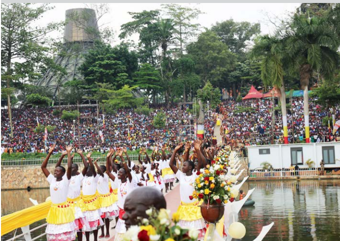
Liturgical dancers during the Martyrs Day celebration