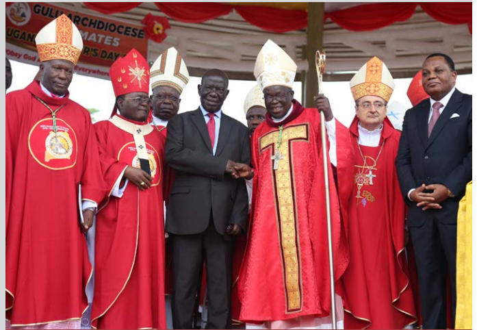
Bishops pose for a group photo with the Vice President, H.E. Edward Ssekandi