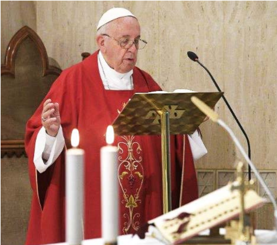
Pope Francis celebrates Mass on Tuesday morning