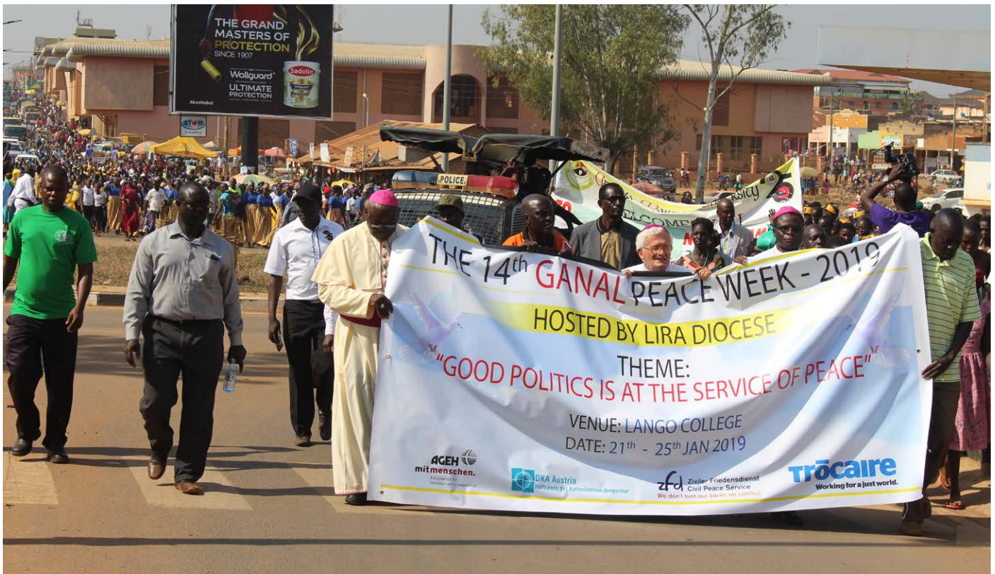
Bishops lead a procession during the Peace Week