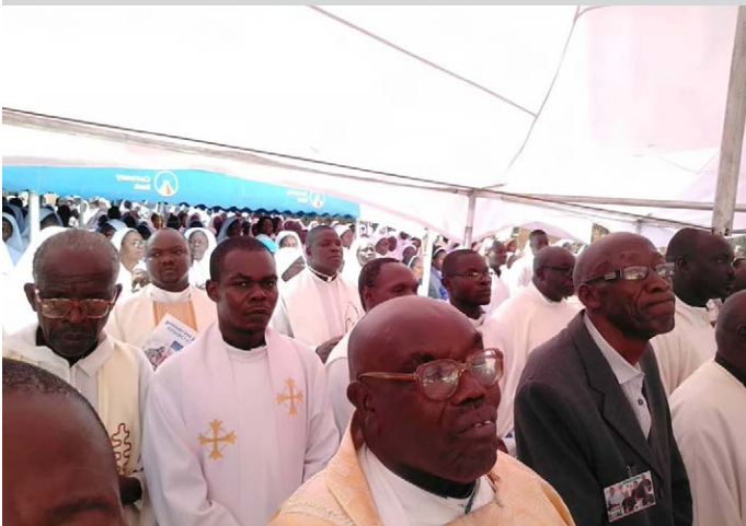
A section of the priests at the installation Mass