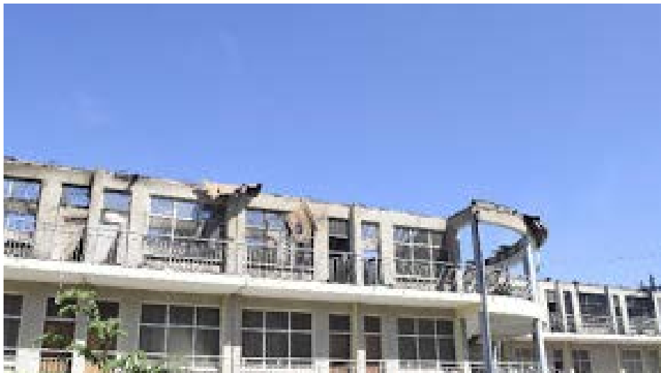
Segerea Major Seminary after the fire disaster.