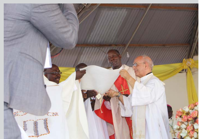
The Consultors of Lira Diocese examining the Papal Bull appointing Bishop Sanctus to Lira