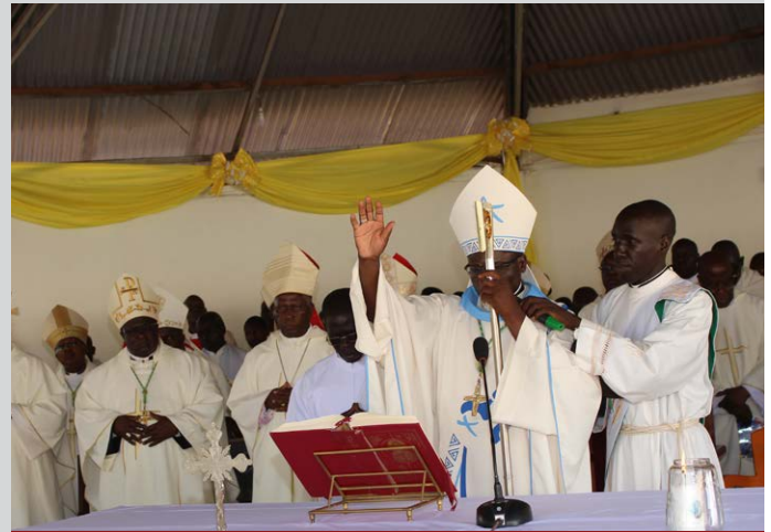
Bishop Wanok blessing the people after the installation ceremony