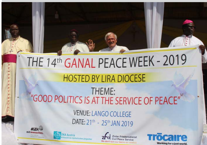
Archbishop Odama (second left) with other Bishops during the Peace Week