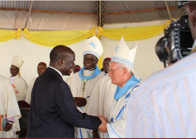
H.E Edward Ssekandi (in black suit) shares a light moment with Bishop Wanok and Bishop Franzelli during the ceremony