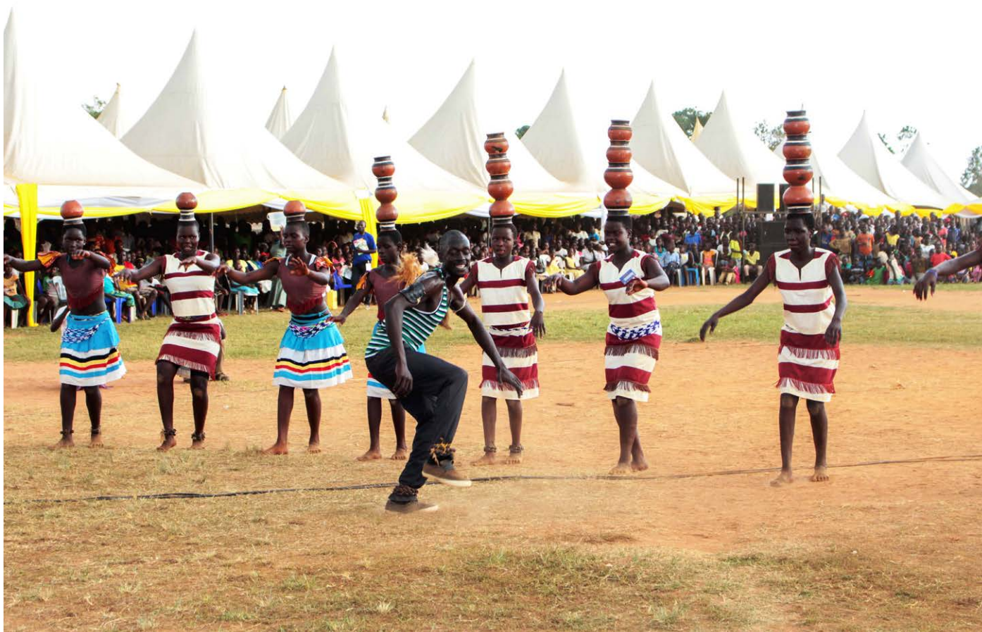
Cultural dancers perform during the Peace Week