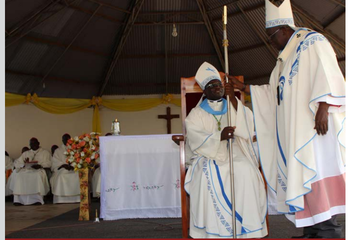
Archbishop Odama (standing) installs Bishop Wanok as new Bishop of Lira Diocese