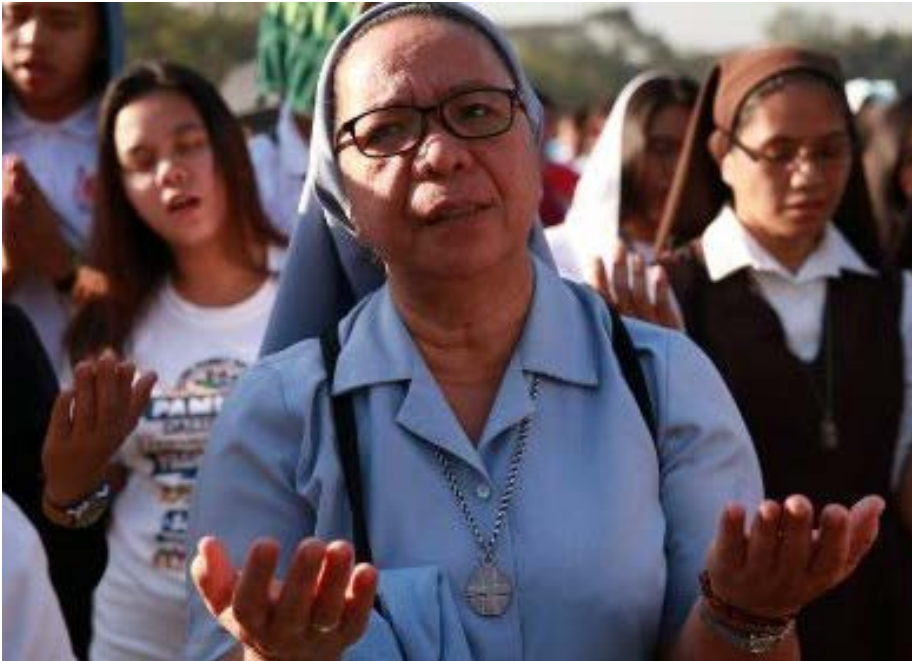
Religious women ask for pardon