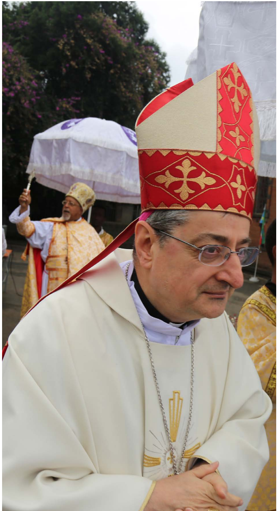
The new Apostolic Nuncio to Uganda, H.E Luigi Bianco

Subsequently, he was also nominated Apostolic Nuncio to Djibouti and Apostolic Delegate to Somalia on September 10, 2014.