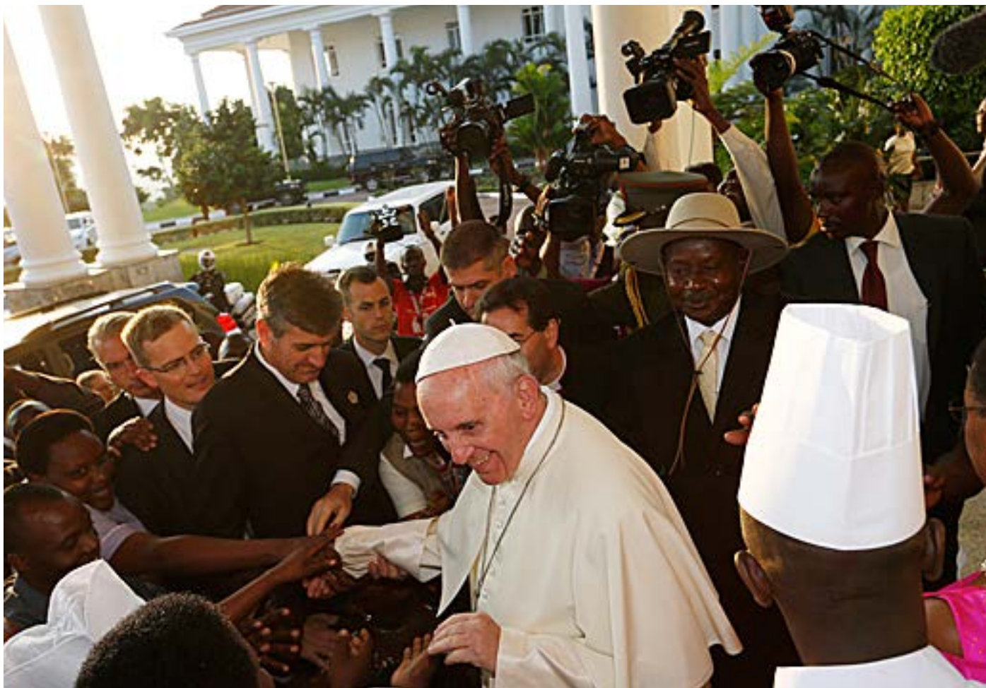
Pope Francis during his trip to Africa

By Media Officer, Uganda Episcopal Conference