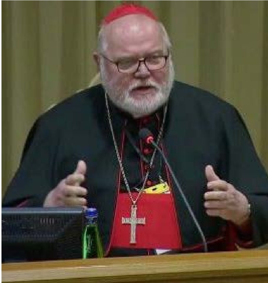
Cardinal Marx addresses fellow bishops during the meeting on protection of minors in the church.