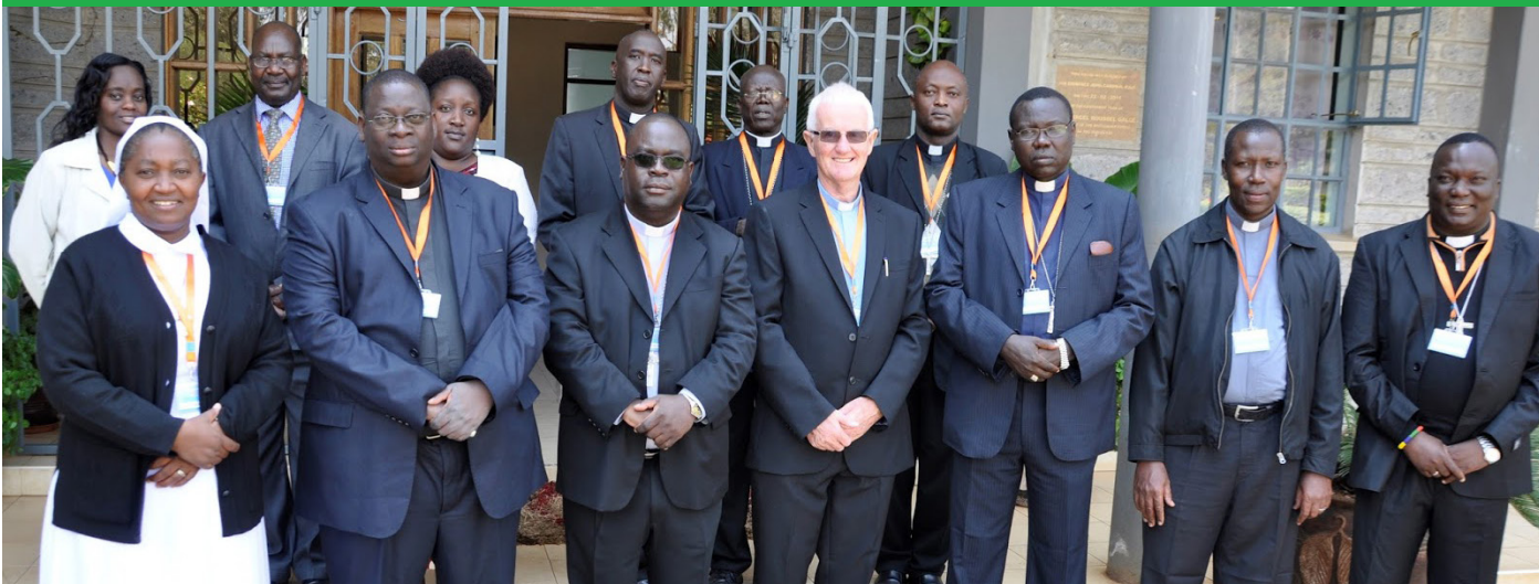
Participants of AMECEA capacity building workshop pose for a group photo

The AMECEA Secretariat in collaboration with the United States Conference of Catholic Bishops (USCCB) conducted another Capacity Building workshop for Bishops in the AMECEA region.