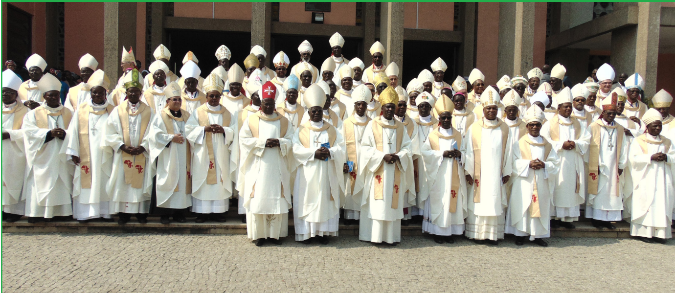
Some of the Bishop-delegates of the 17th Plenary Assembly of SECAM

By Father Don Bosco Onyalla, Nairobi, CANAA