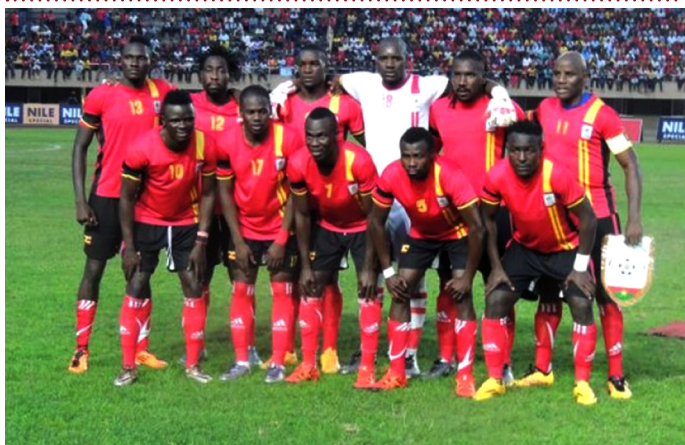
Uganda Cranes Team that beat Comoros

On 4th September, the National football team—Uganda Cranes hosted the Comoros for the AFCON 2016 qualifiers play-off match. This was a do-or-die qualification match the Uganda Cranes managed to win. The