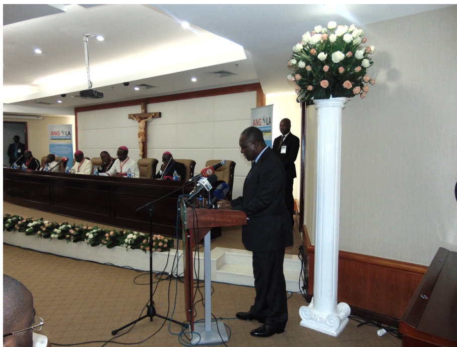
Vice- President of Angola, Ing. Vicente, delivering a message to the participants.